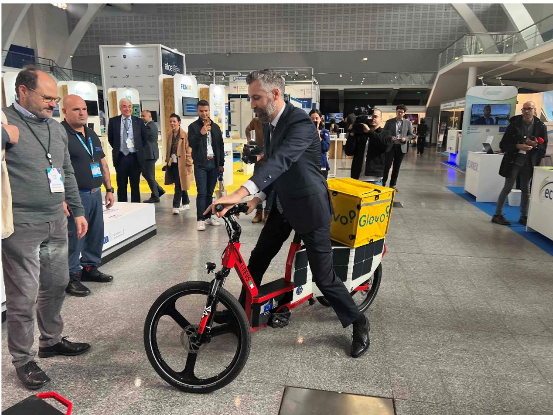
Image 3 - Minister of Infrastructure and Housing, Pedro Nuno Santos

TRA 2022 takes place at the Lisbon Congress Center until the 17th of November.