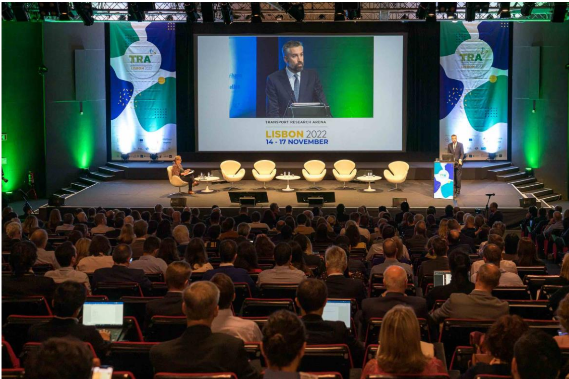
Image 2 - Opening Ceremony